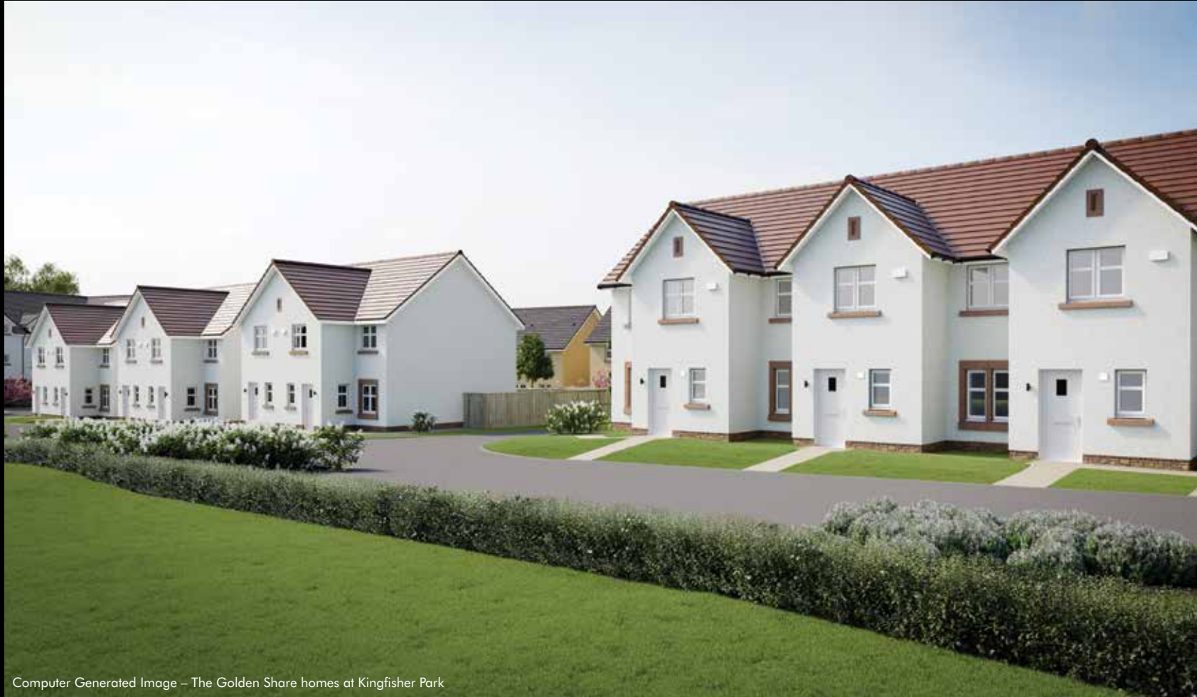
Computer Generated Image – The Golden Share homes at Kingfisher Park