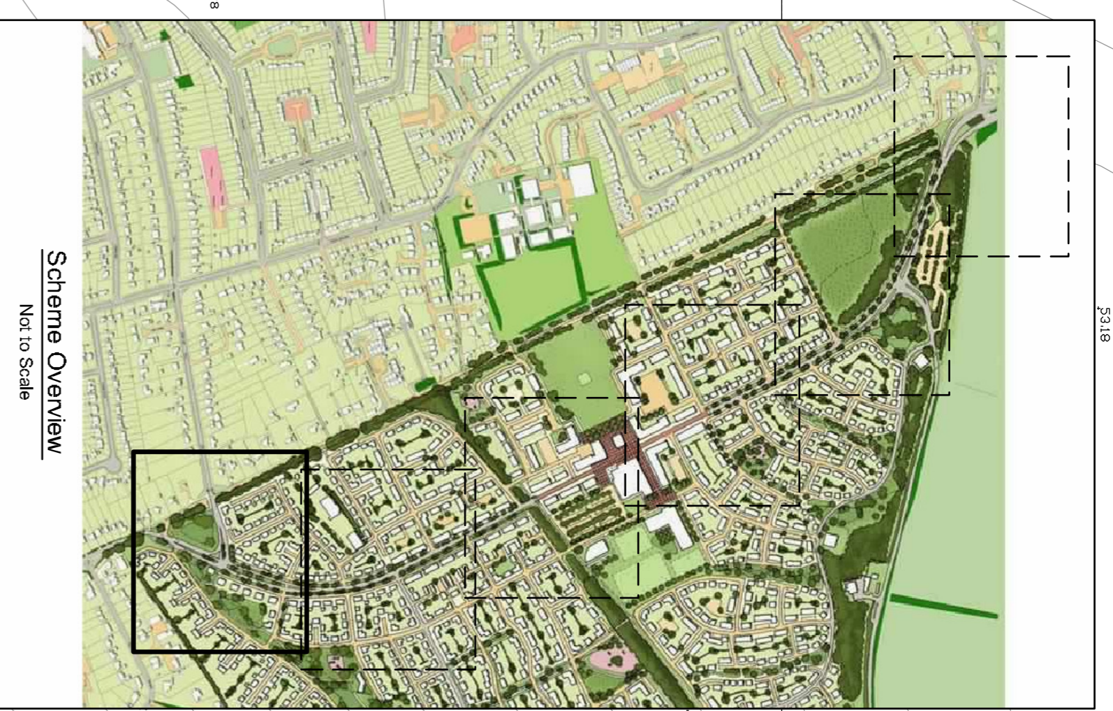
Scheme Overview Natio Scale