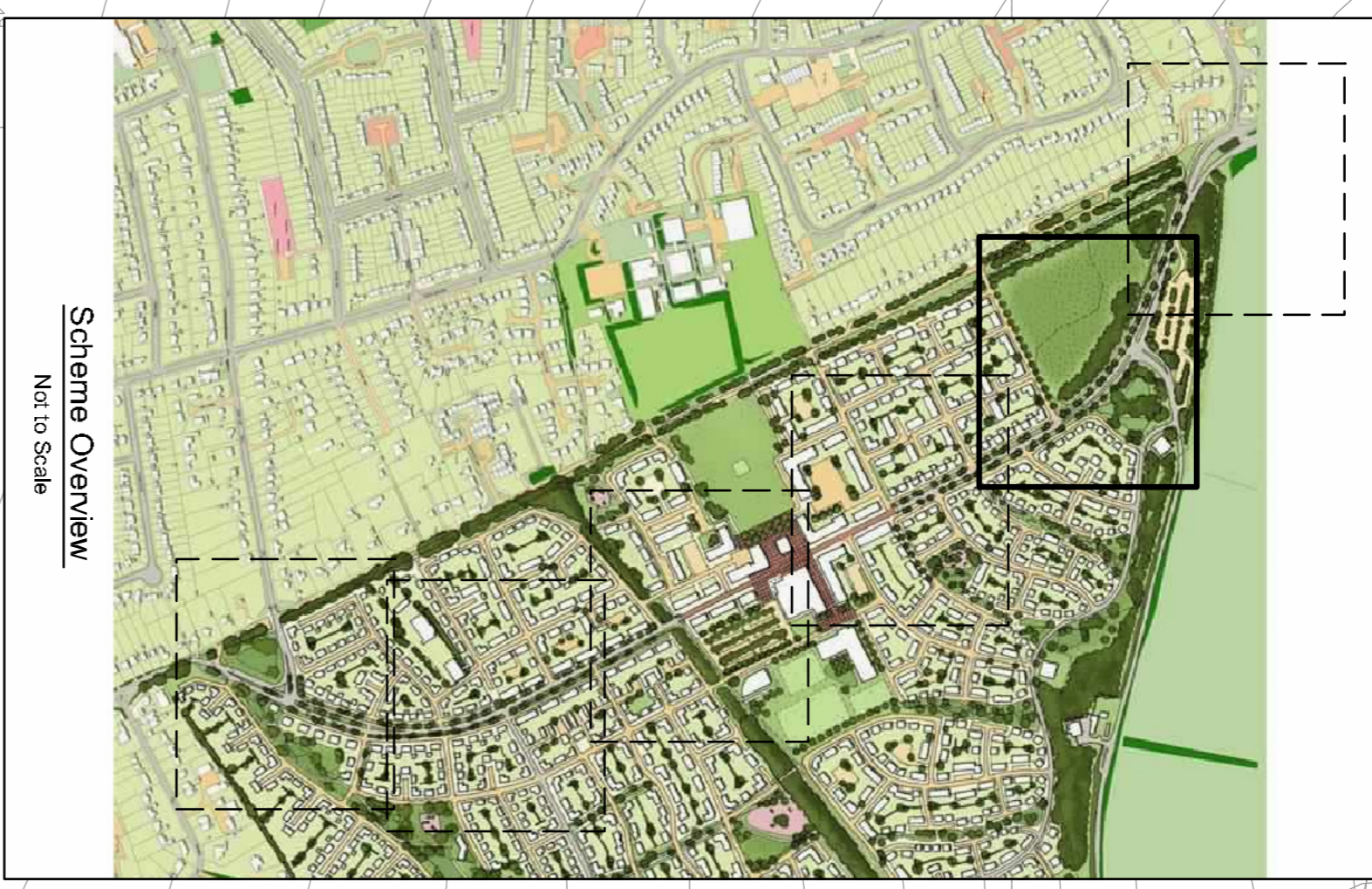
Scheme Overview Not to Scale