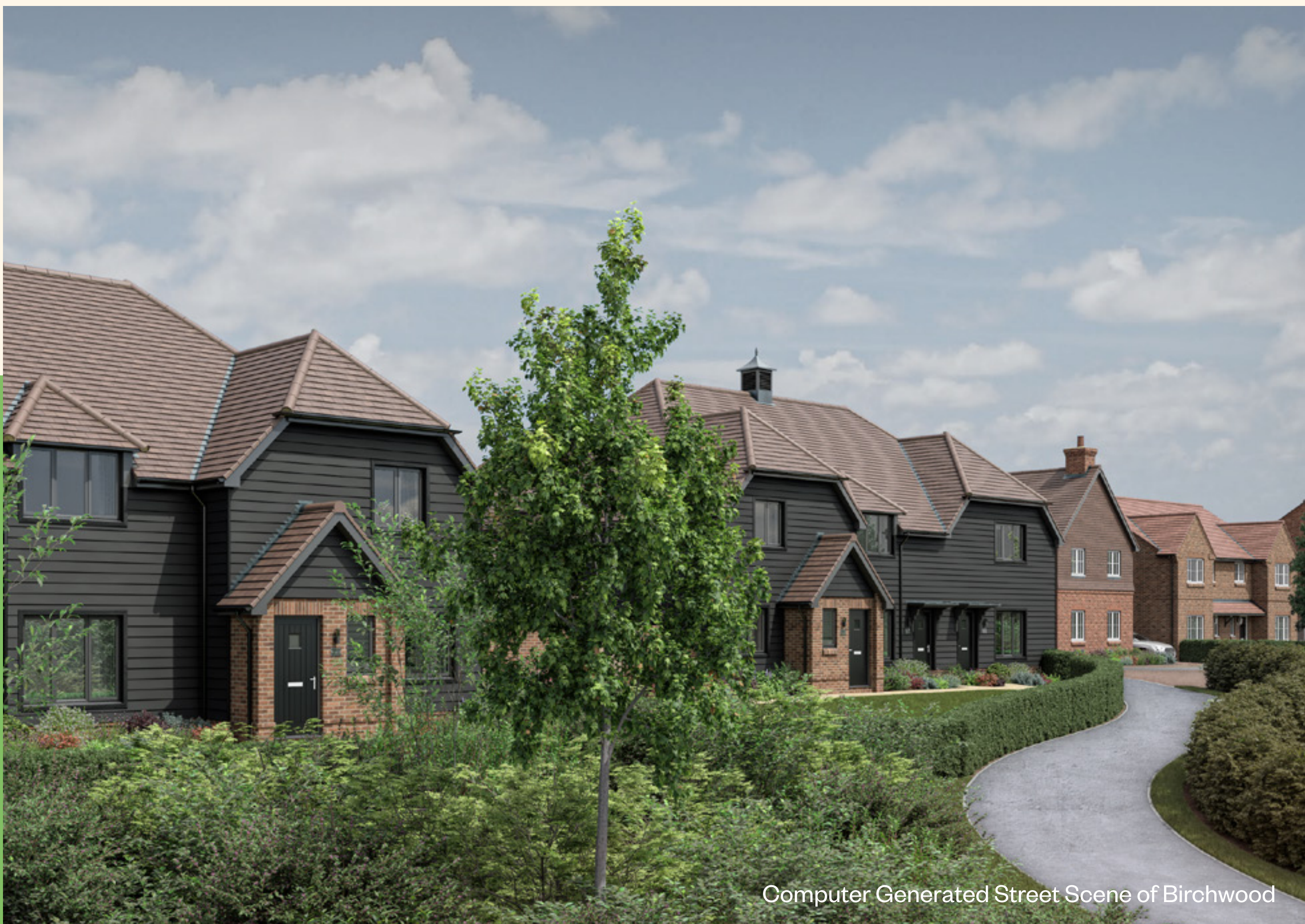
Computer Generated Street Scene of Birchwood

Located on the edges of bustling Farnham, a sought-after market town in leafy Surrey, Birchwood is a new collection of stylish 1 & 2 bedroom apartments and 2, 3, 4 & 5 bedroom houses for sale in one of South East England's most desirable areas. Here, these superb, high specification homes benefit from an ideal location, with Farnham's charming centre minutes away in the car.