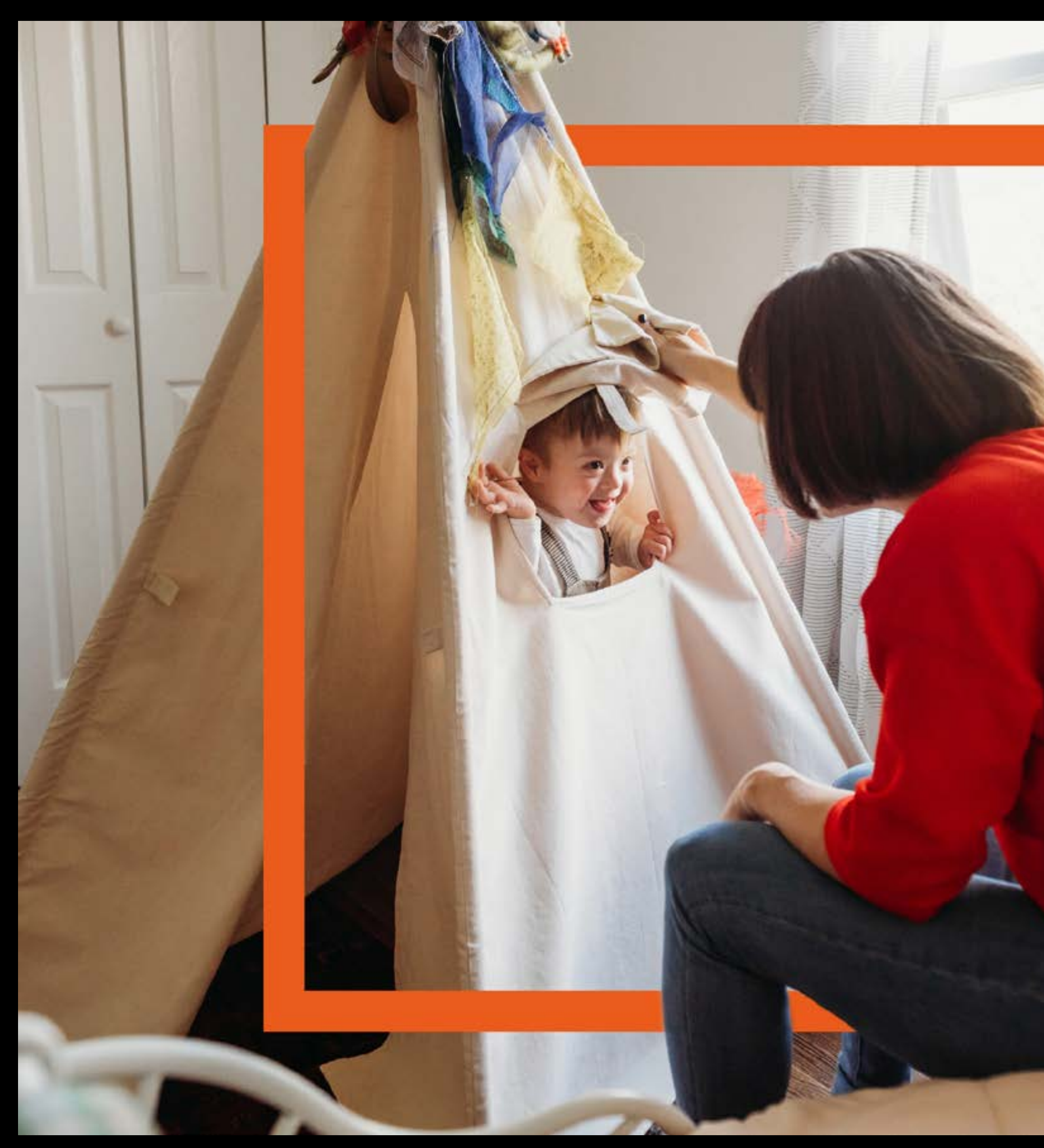
IMPORTANT NOTICE TO CUSTOMERS: The Consumer Protection from Unfair Trading Regulations 2008. Cala Homes (North) Limited operates a policy of continual product development and the specifications outlined in this brochure are indicative only. We reserve the right to implement minor changes to the sizes and specifications shown on any plans or drawings in this brochure without warning. Where alterations to the design, construction or materially alter the internal floor space, appearance or market value of the property, we will ensure that these changes are communicated to potential purchasers. Whilst these particulars are prepared with all due care for the convenience of intending purchasers, the information is intended as a guide. The computer generated images and photographs do not necessarily represent the actual finishings/elevation or treatments, landscaping, furnishings at this development. Floor plans, dimensions and specifications are correct at the time of print. The illustrated location map is a general guide only. Please note that distances and timings referred to in this brochure are approximate and sourced from Google Maps. For information relating to weather in the area of this development, please refer to the Meteorological Office (www.metoffice.gov.uk). Nothing contained in this brochure are approximate and sourced from Google Maps. For information relating to weather in the area of this development, please refer to the Meteorological Office (www.metoffice.gov.uk). Nothing contained in this brochure are approximate and sourced from Google Maps. For information relating to weather in the area of this development, please refer to the Meteorological Office (www.metoffice.gov.uk). Nothing contained in this brochure are approximate and sourced from Google Maps. For information relating to weather in the area of this development, please refer to the Meteorological Office (www.metoffice.gov.uk). Nothing contained in this brochure are approximate and sourced from Google Maps. For information relating to weather in the area of this development, please refer to the Meteorological Office (www.metoffice.gov.uk). Nothing contained in this brochure are approximate and sourced from Google Maps. For information relating to weather in the area of this development, please refer to the Meteorological Office (www.metoffice.gov.uk). Nothing contained in this brochure are approximate and sourced from Google Maps. For information relating to weather in the area of this development, please refer to the Meteorological Office (www.metoffice.gov.uk). Nothing contained in this brochure are approximate and sourced from Google Maps. For information relating to weather in the area of the Scotland company number SC465071. Registered Office: Johnstone House, 52-54 Rose Street, Aberdeen, ABIO 1HA. Cala Homes (North) Limited act as an agent for Cala Management Limited - registered office: Johnstone House, 52-54 Rose Street, Aberdeen, ABIO 1HA. Cala Homes (North) Limited act as a