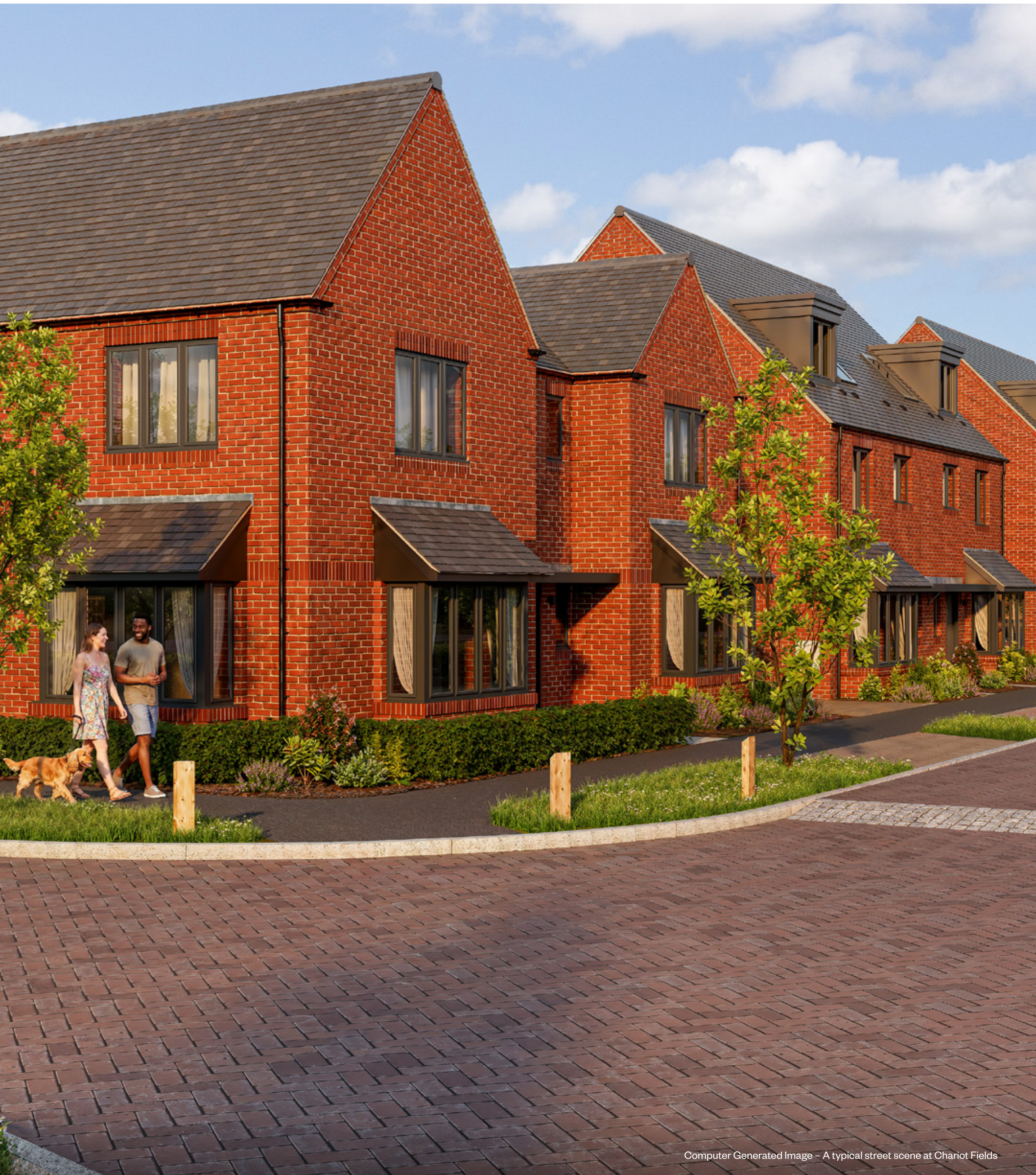
Computer Generated Image - A typical street scene at Chariot Fields