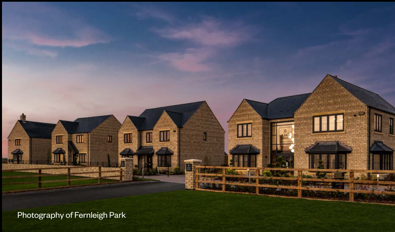
Photography of Fernleigh Park