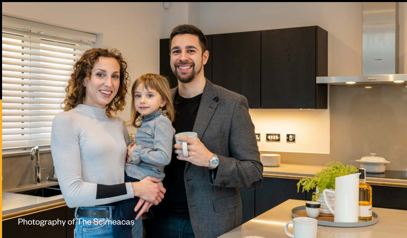
Photography of The Scimeacas

“There’s nothing quite like moving into a brand-new home, from newly-installed kitchens and bathrooms to the peace of mind of knowing that your property is safe, energy efficient and low maintenance.