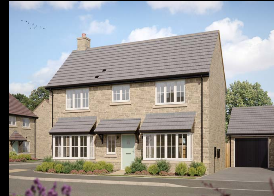
The Rowan 4 bedroom detached home