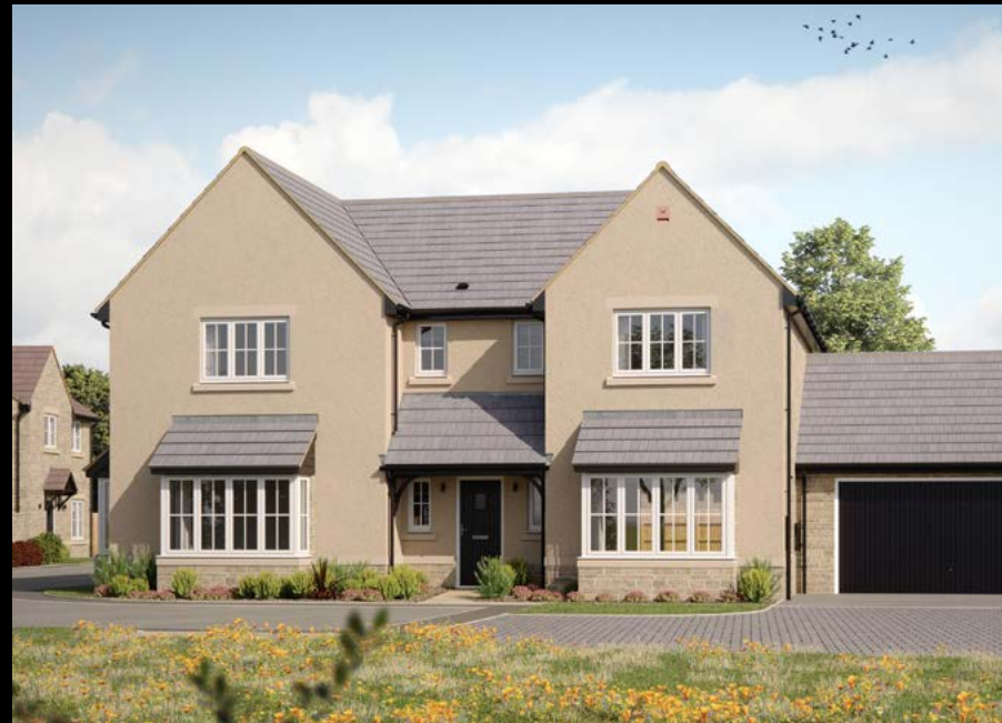
The Yew 5 bedroom detached home