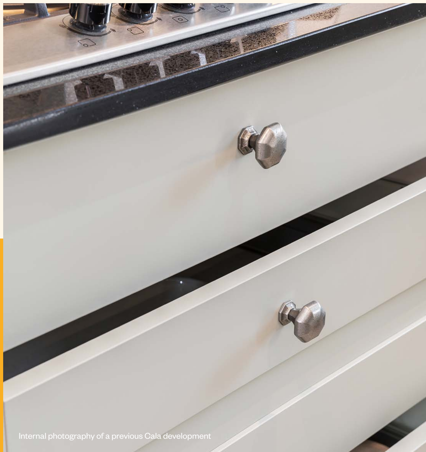
Internal photograph of a previous Cala development