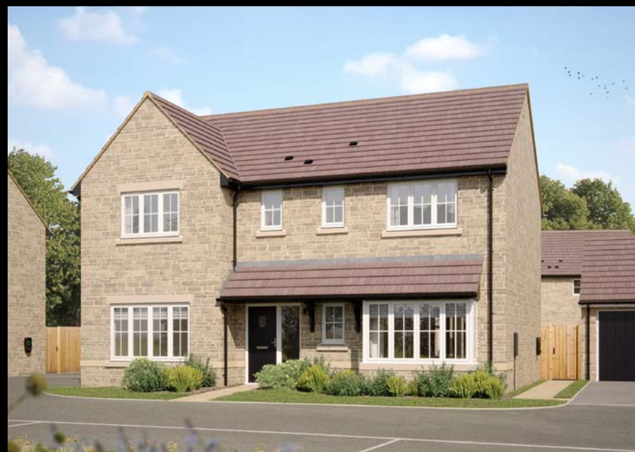
The Walnut 4 bedroom detached home