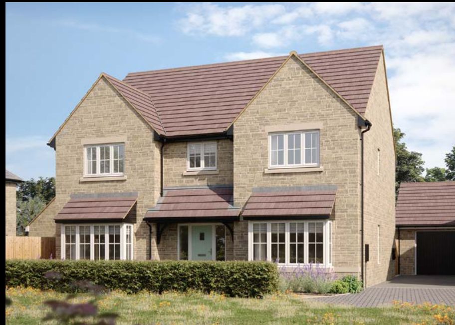
The Willow 5 bedroom detached home