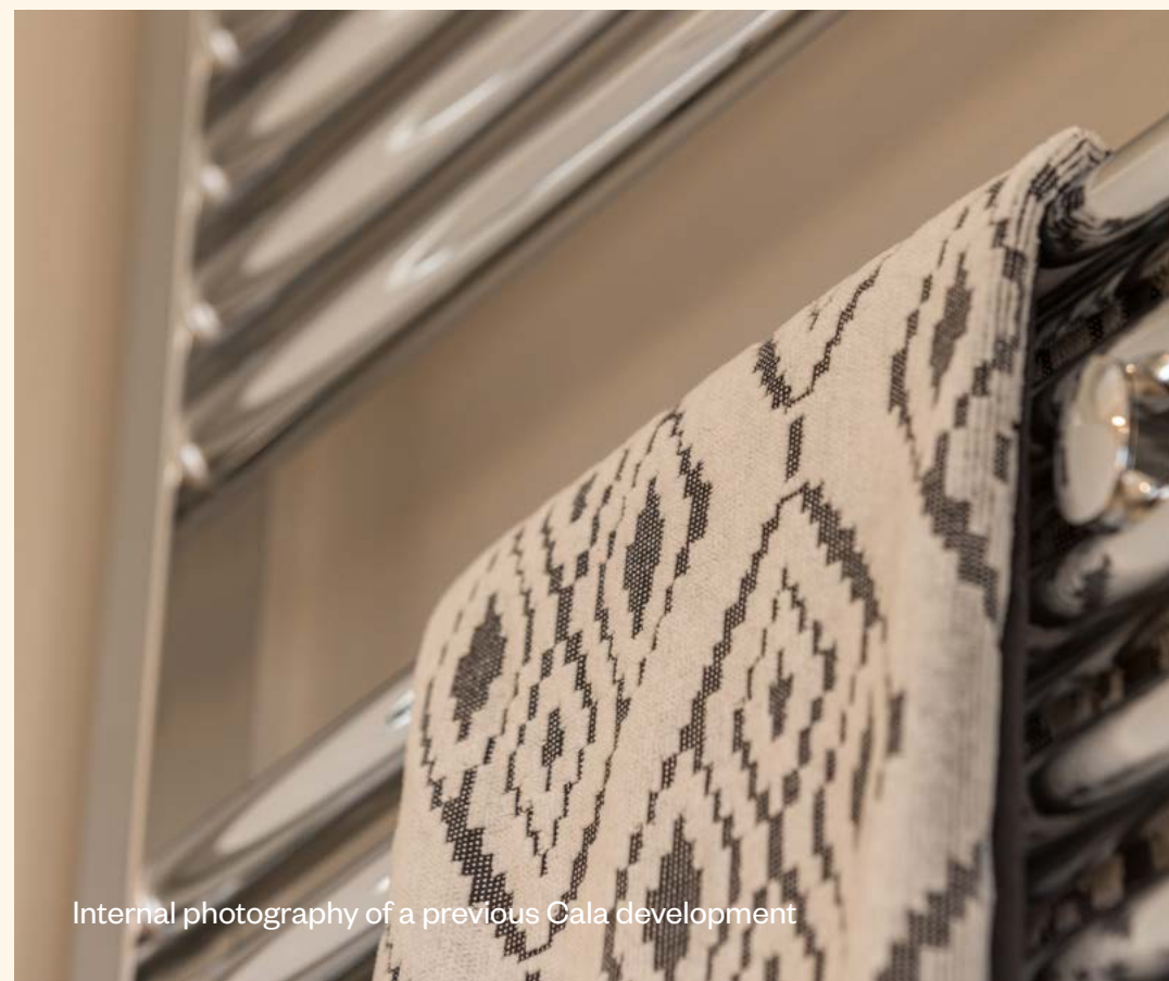
Internal photography of a previous Cala development

With every home comfort considered for energy-efficient and low maintenance living, each aspect of your family home is beautifully designed and built to an exacting standard; because when you look for quality, it's the little things that make all the difference.