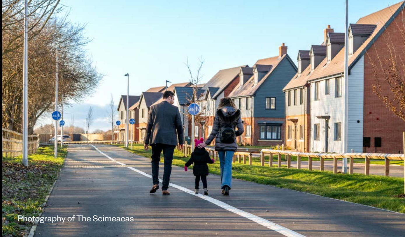
Photography of The Scimeacas