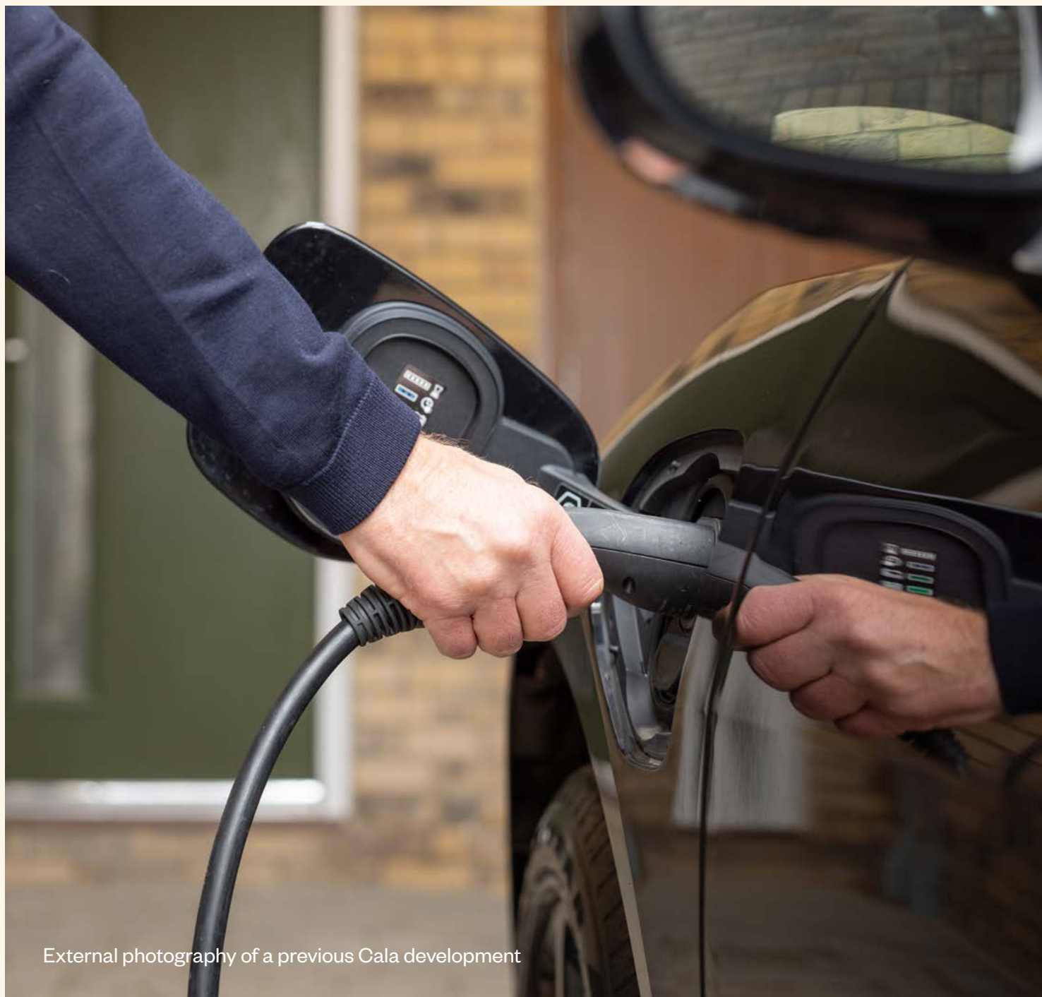
External photography of a previous Cala development