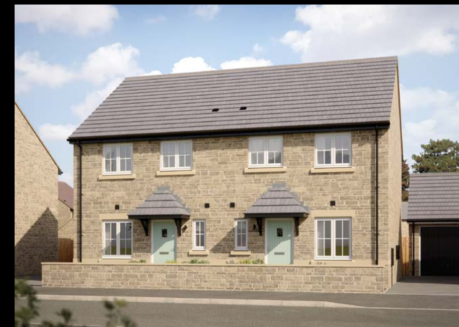
The Bayberry 2 bedroom semi-detached home