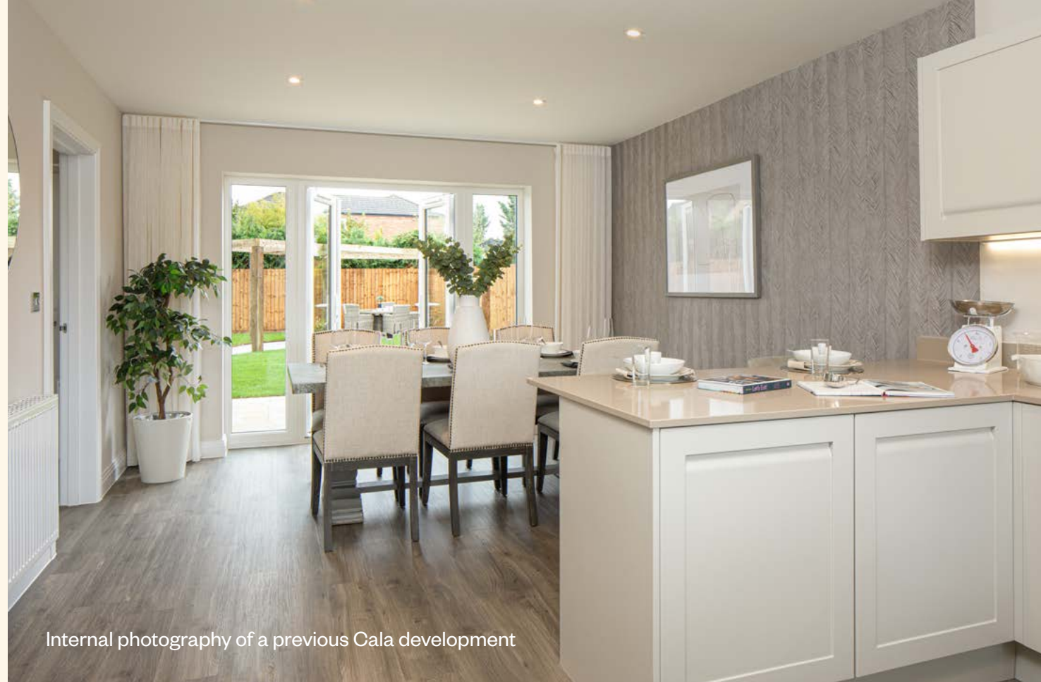
Internal photograph of a previous Cala development