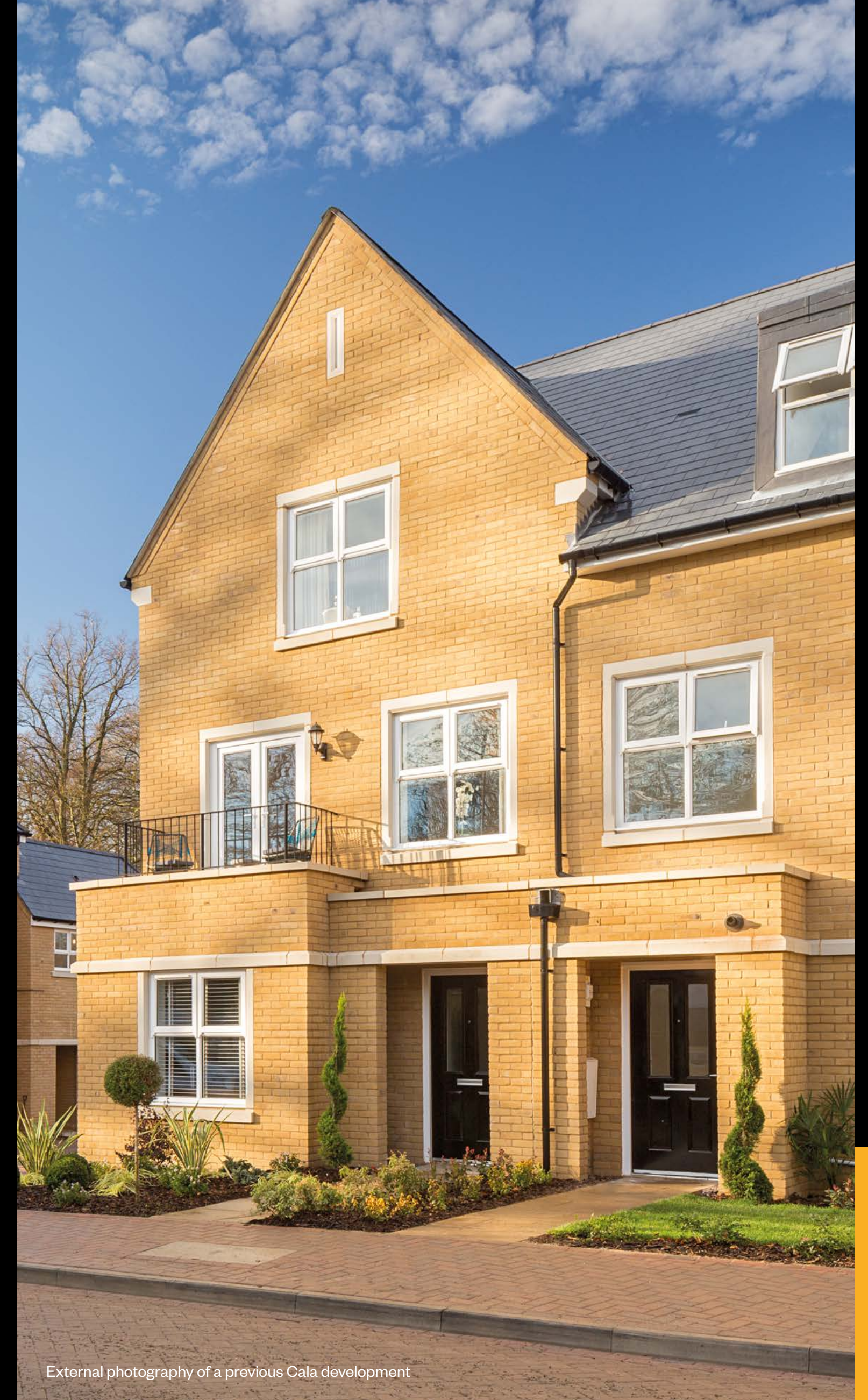
External photography of a previous Cala development