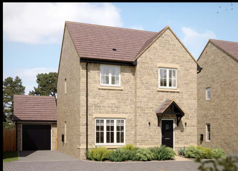
The Laurel 3 bedroom detached home with study