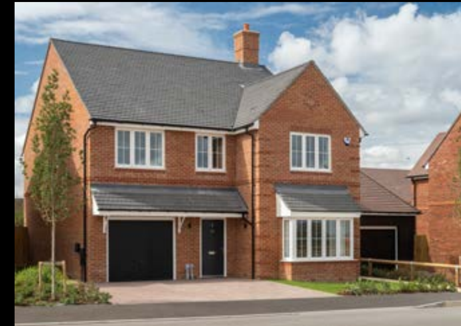
The Whiterose 5 bedroom detached home