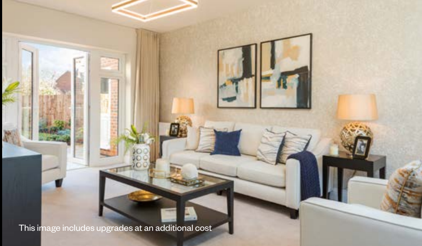
This image includes upgrades at an additional cost