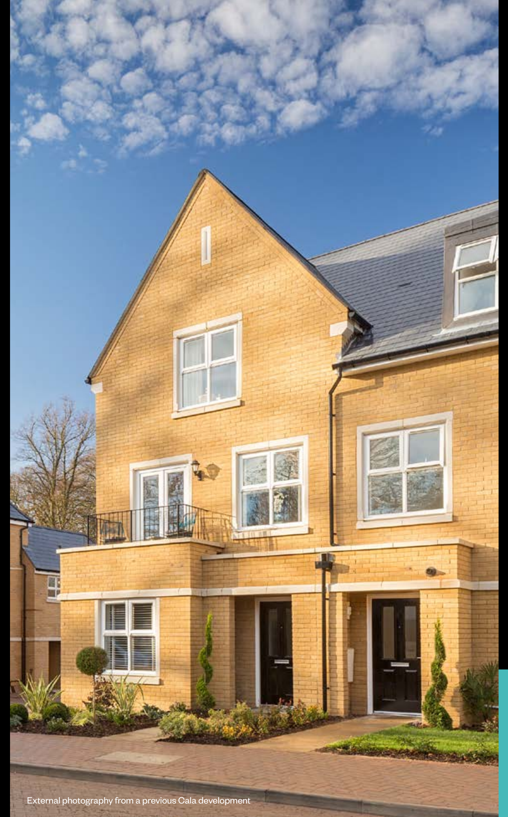
External photography from a previous Cala development