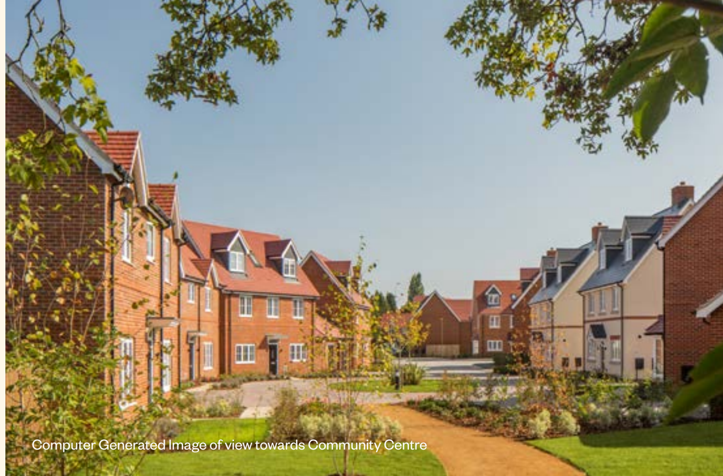
Computer Generated Image of view towards Community Centre