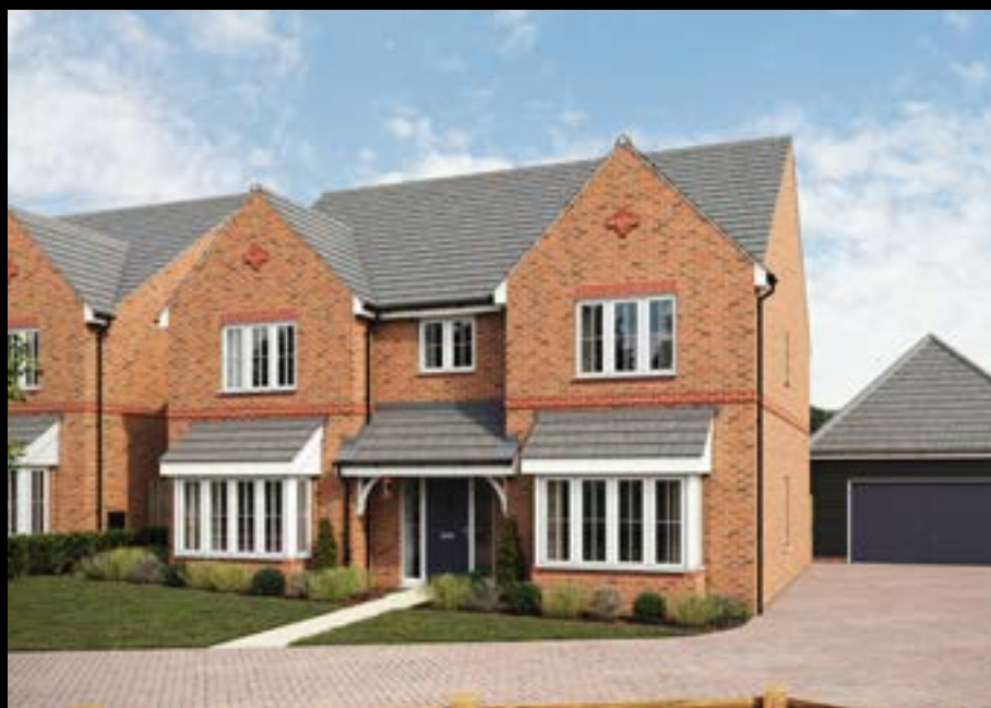
The Wilstone 5 bedroom detached