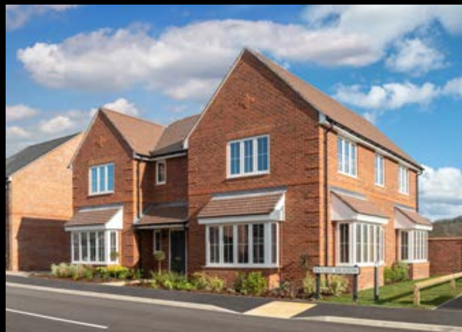
The York 5 bedroom detached house