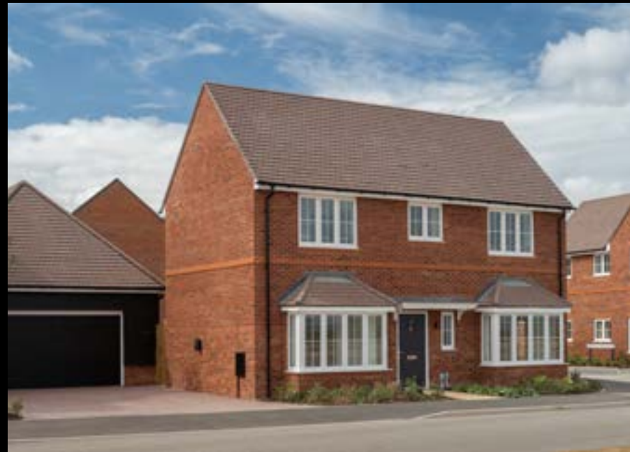
The Ruben 4 bedroom detached home