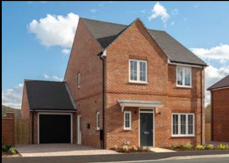
The Oaken 4 bedroom detached home