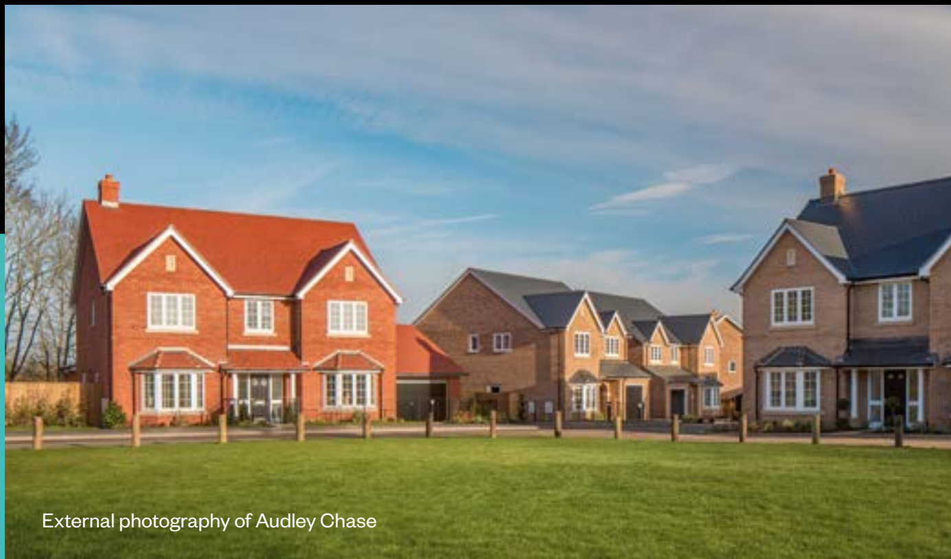
External photography of Audley Chase