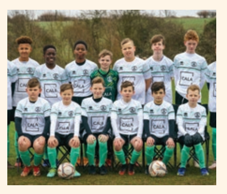
Chelmsford City Youth Football Club - £1,000