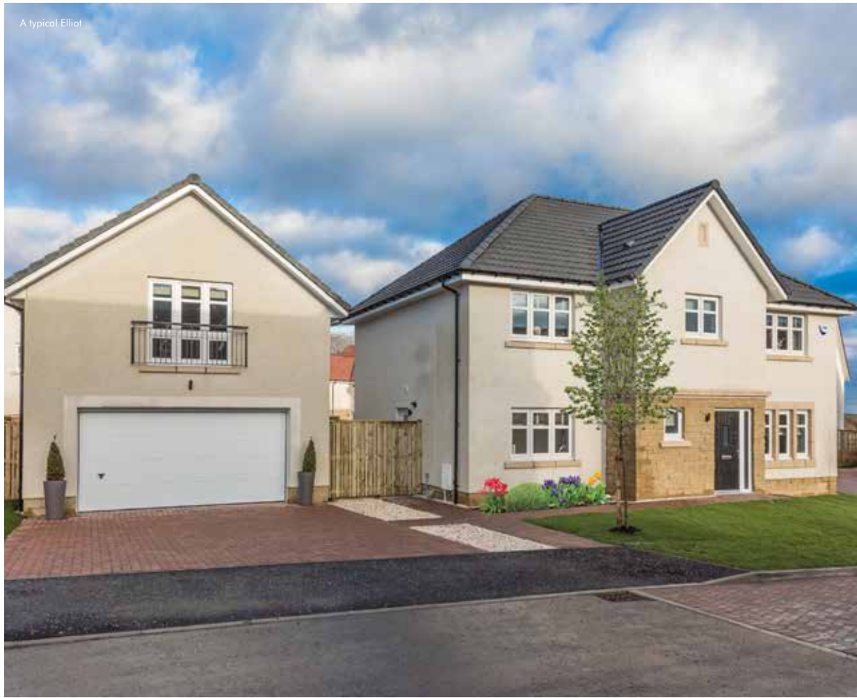
A typical Elliot