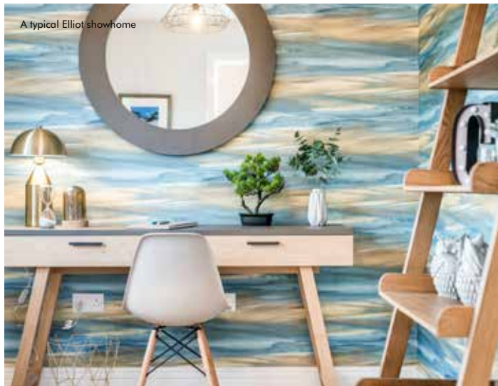
A typical Elliot showhome