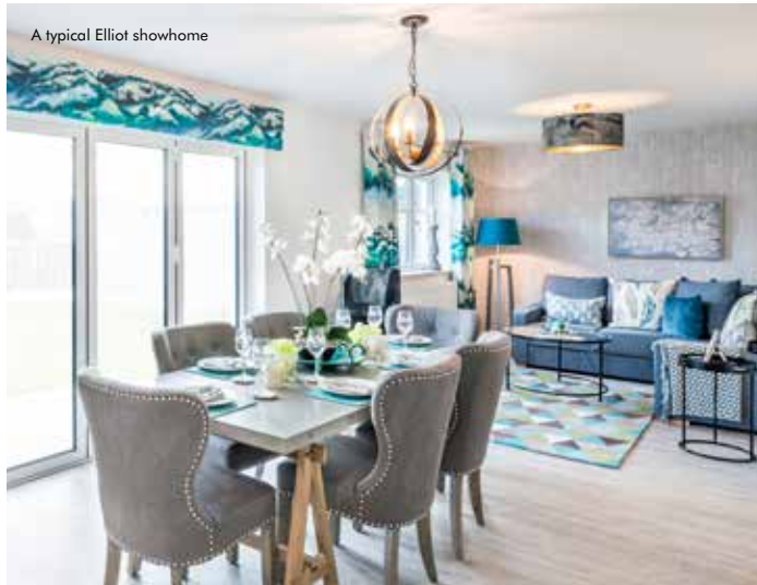
A typical Elliot showhome

This is life with more style. This is The Elliot.