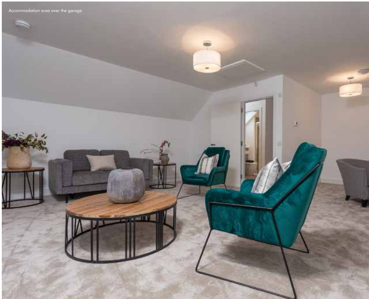
Accommodation area over the garage

“The finish of the house is really good, all of the little details are really good and the quality is done to a really high standard.”