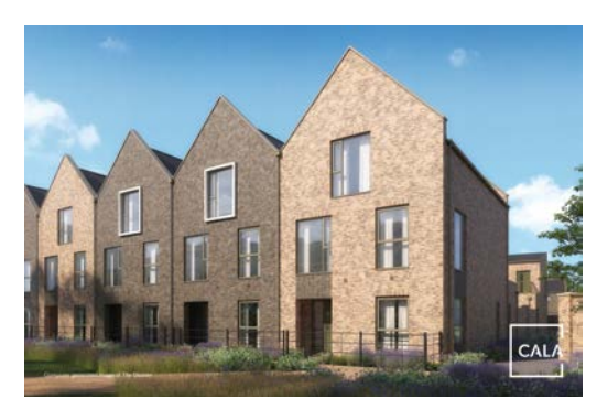
Housing from Stonebond and CALA