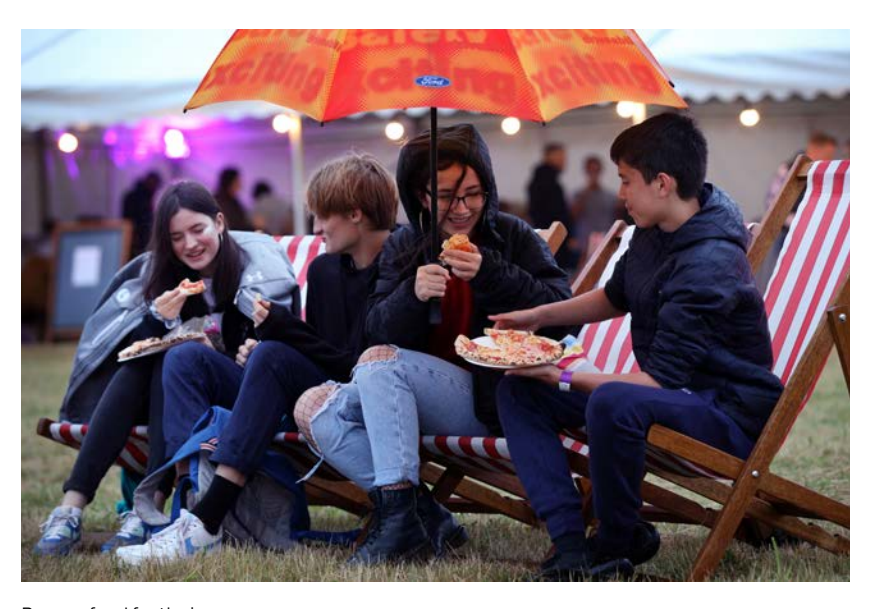
Pop-up food festivals

Whether you want to relax by the lake or feel energised by taking part in one of the many community groups, events and activities at Waterbeach, you can choose your own pace and be invigorated by the energy of urban living or relax in the tranquillity of nature.