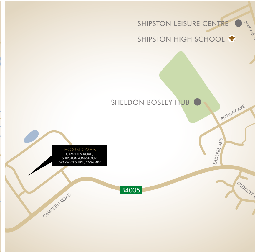
LOCAL AREA MAP