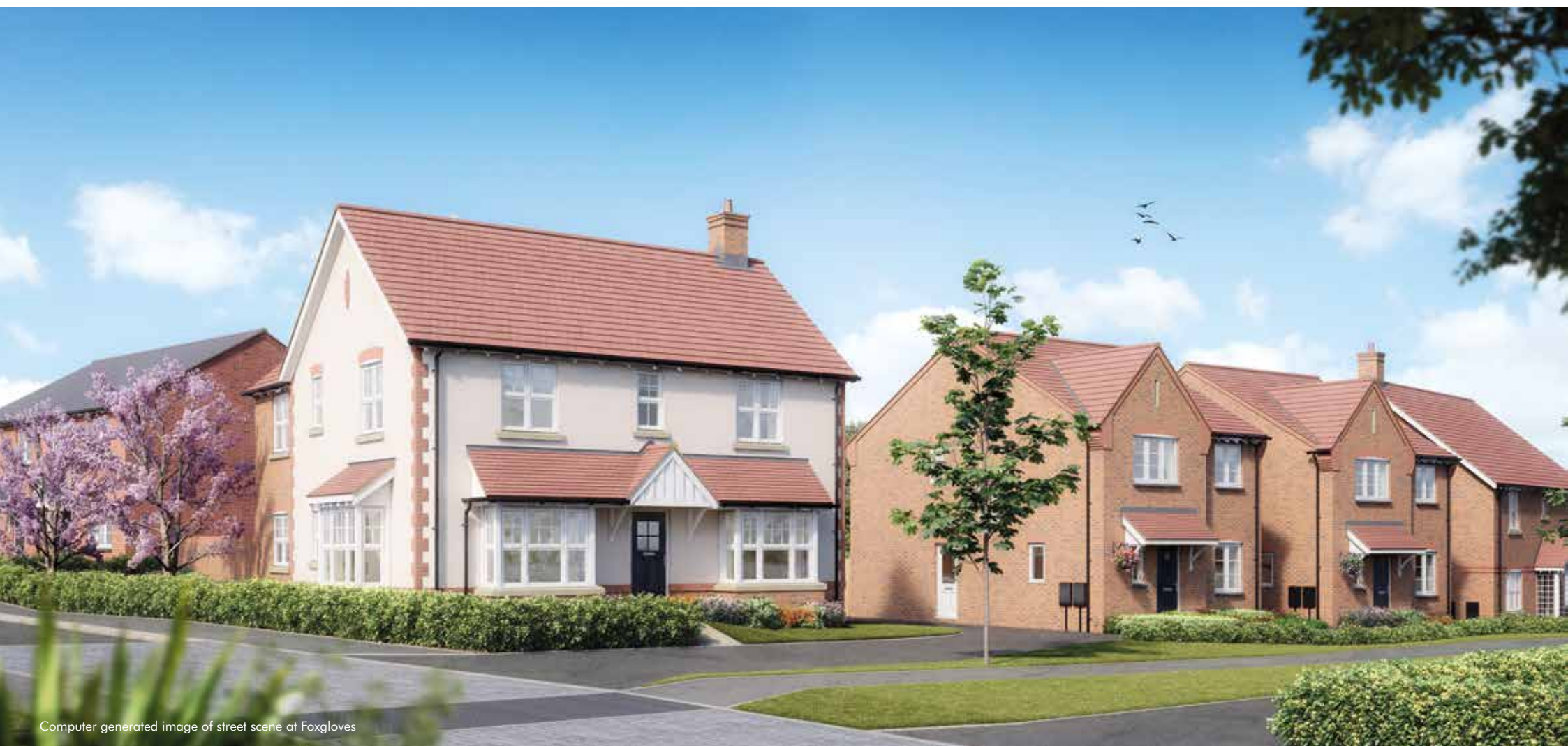
Computer generated image of street scene at Foxgloves