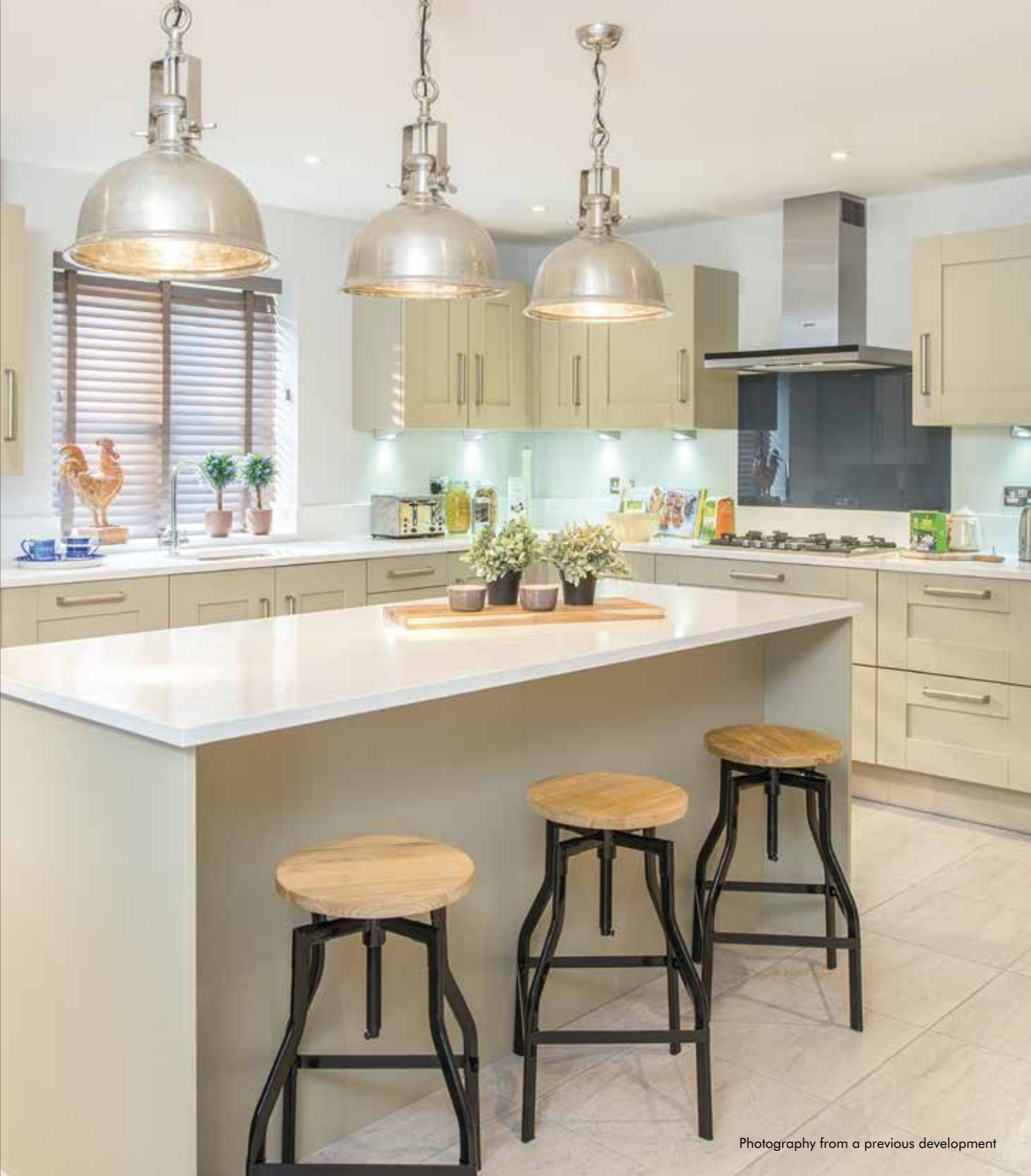
Photography from a previous development