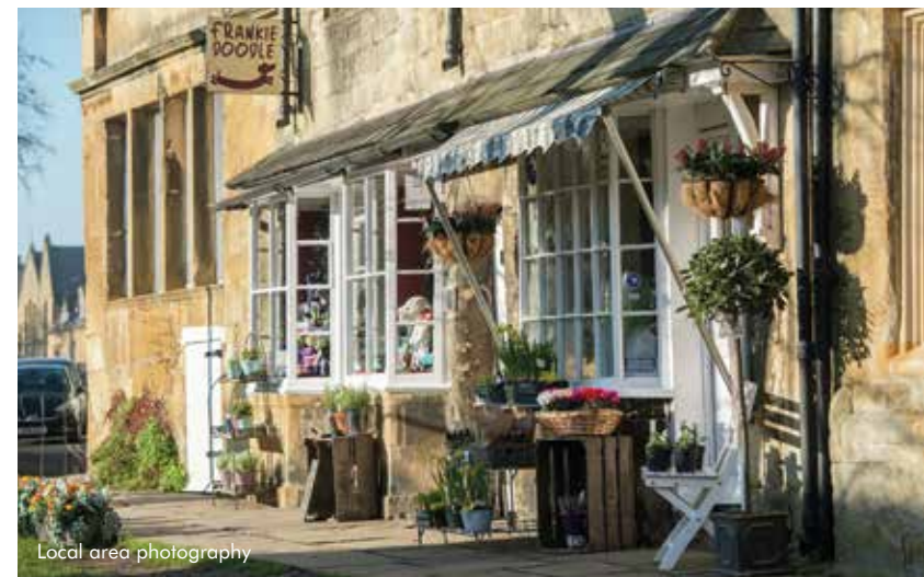
Local area photography