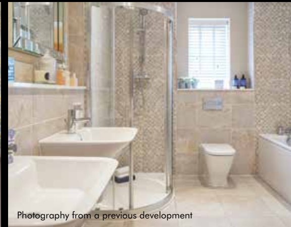
Photography from a previous development