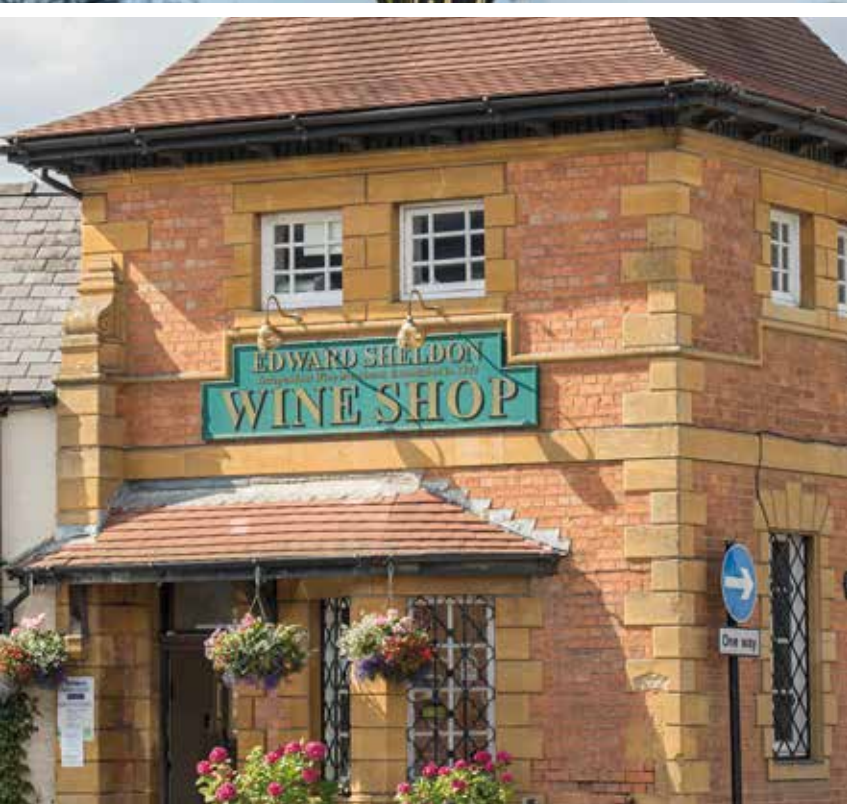
Local area photography