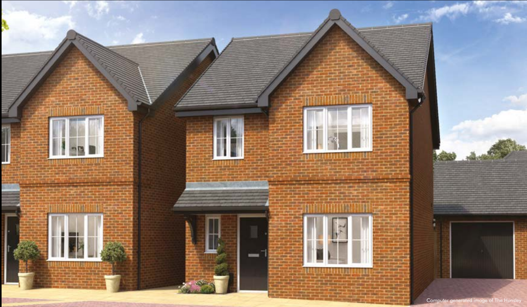
Computer generated image of The Hunsley