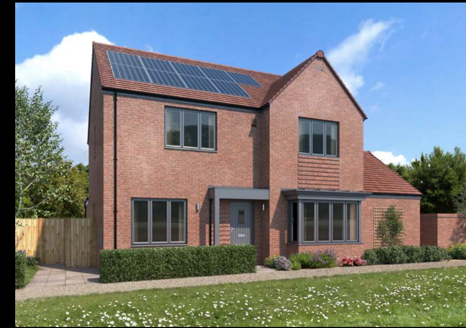
The Pecan 4 bedroom detached home