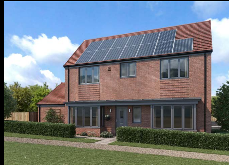
The Rowan 4 bedroom detached home