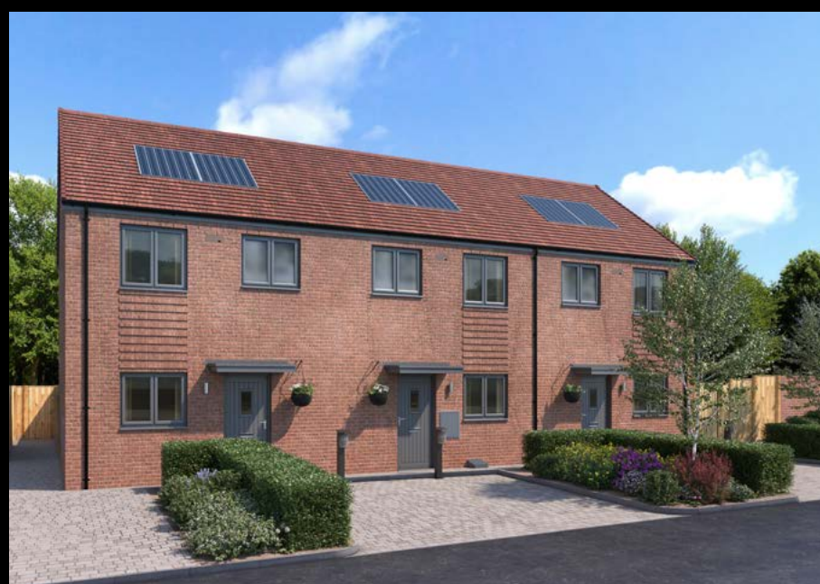
The Alder 2 bedroom terraced home