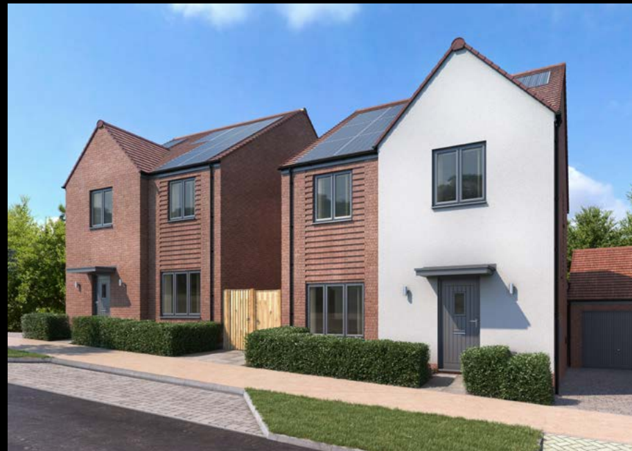
The Laurel 4 bedroom detached home