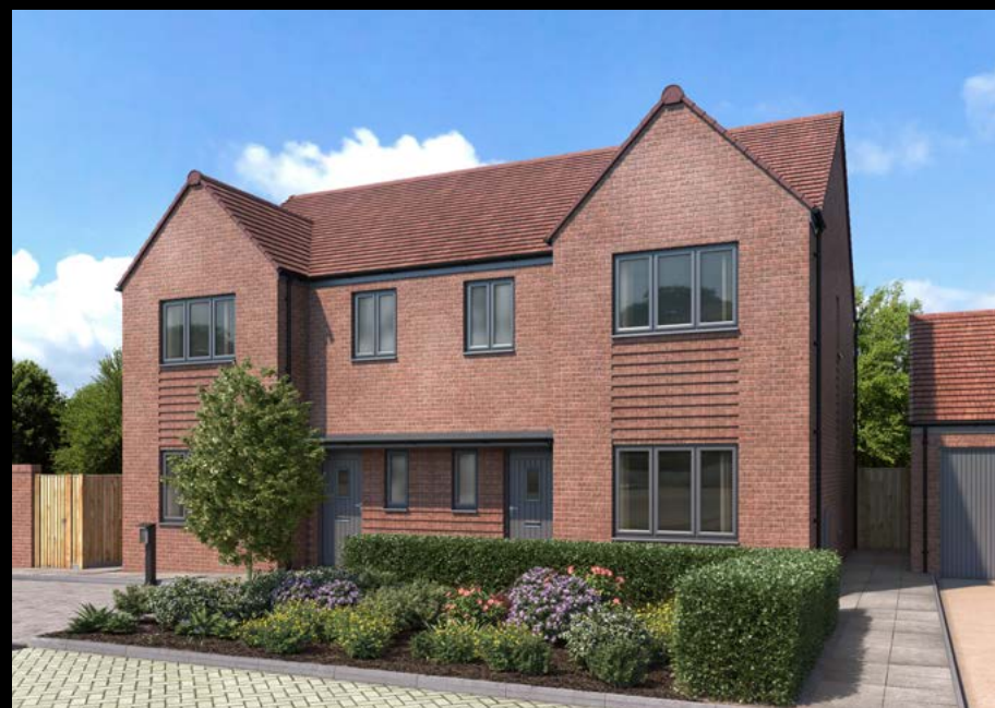
The Fir 3 bedroom semi-detached/ detached home