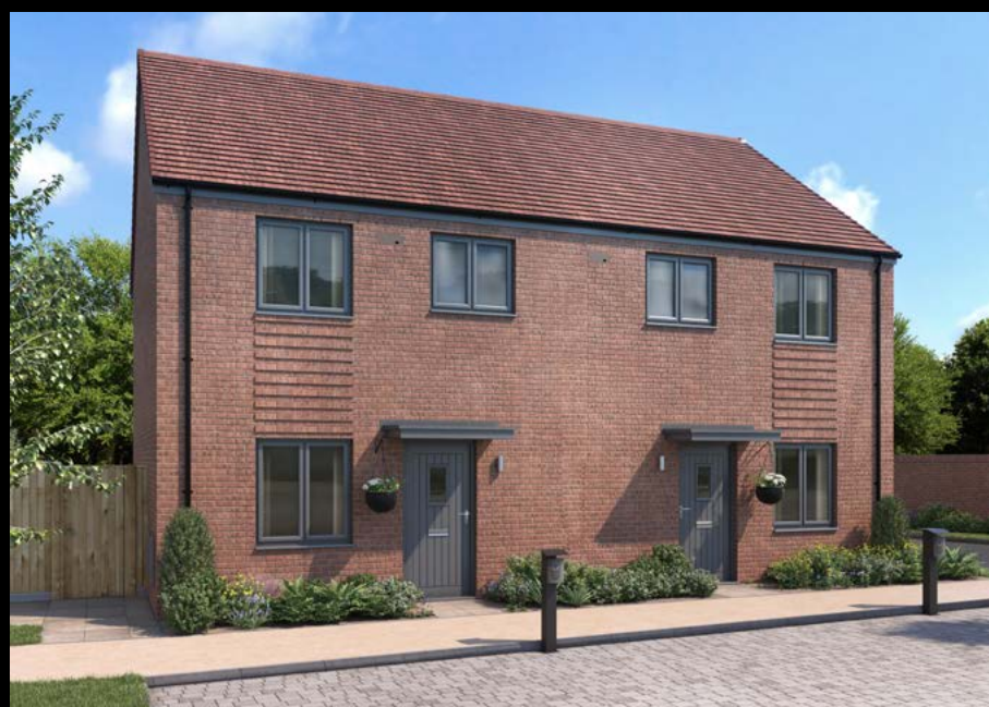
The Bayberry 2 bedroom semi-detached/ terraced home