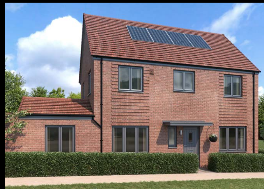
The Everglade 3 bedroom detached home

Click here for current availability and prices