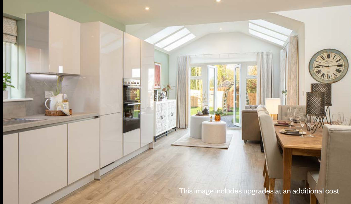
This image includes upgrades at an additional cost