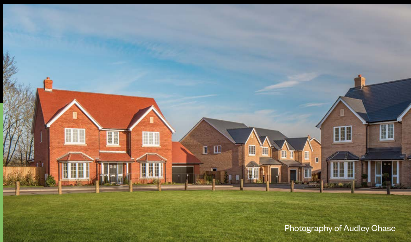
Photography of Audley Chase

The Staceyfounds, Purchasers at St Peter's Quarter